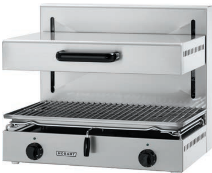
SAE560 Salamander grill with adjustable height heat source

The three-sided access models have a movable base and top, enabling the operator to increase or reduce the intensity of the heat on the product to achieve the desired finished effect.