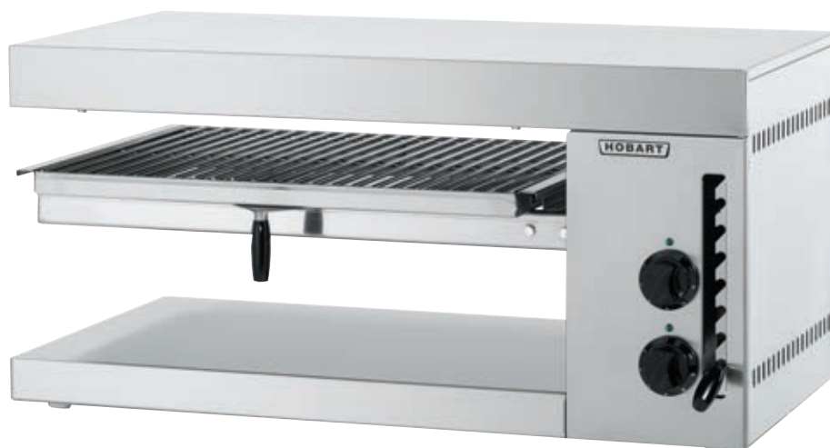
SAE650 Salamander grill with adjustable height grilling shelf