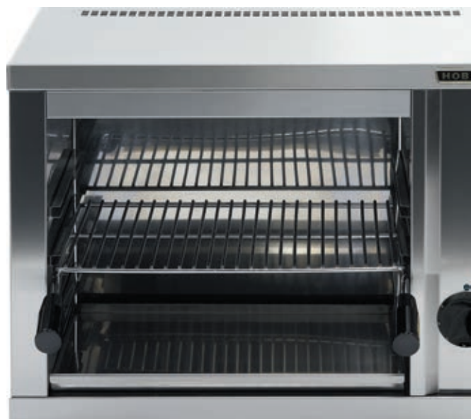
SET 1 Grill Salamander with three fixed rack positions