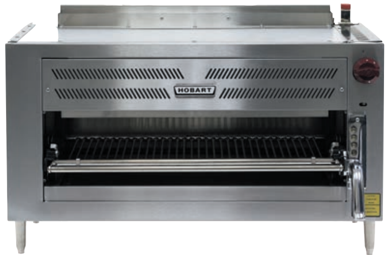
IRB36E Salamander with Infra red burner and Pistol grip height adjuster