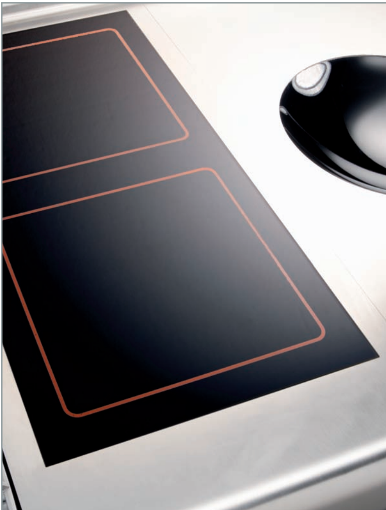
Laser cut and welded 2mm tops give an unparalleled finish to the Optimum 900 line – virtually seamless.