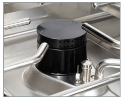
Powerful 8.8kw and 5.5kw burners employing our horizontal flame technology means faster heating with less energy consumption.