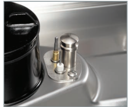
With electronic ignition as a standard feature the optimum 900 avoids the inconvenience of manual lighting and is ready to use when you are.