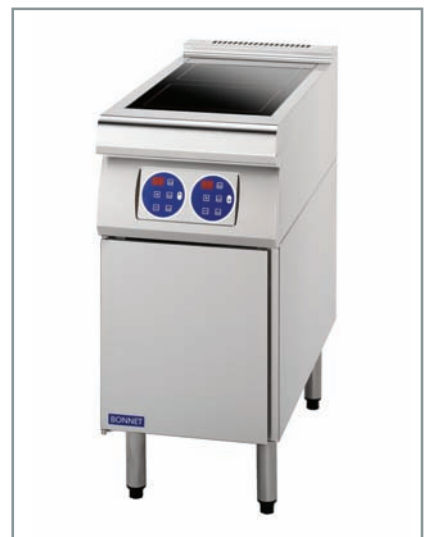
Powerful energy efficient 5kw induction zones offer the ultimate in controllable, comfortable cooking. Fast, efficient, economical and easy to clean.